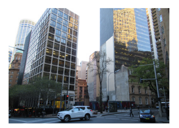
Figure 2.7 Looking west from the intersection of Castlereagh Street and Hunter Street showing the existing setting of the heritage item Richard Johnson Square