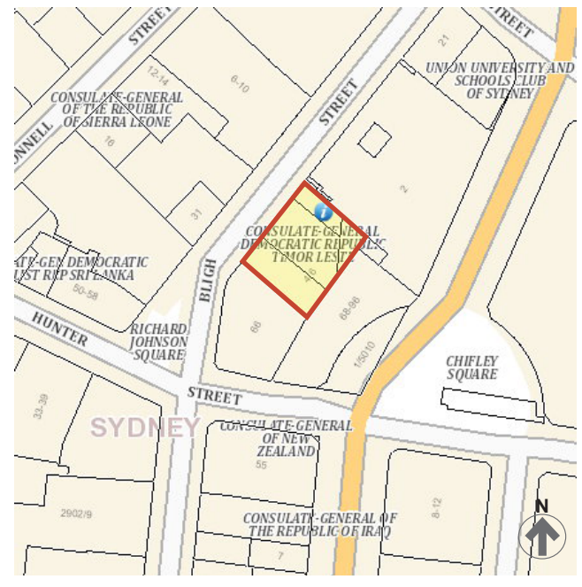
Figure 1.1 Location map showing the subject site outlined in red and shaded yellow

It considers the impact of potential future developmentin relation to the relevant provisions established by the City of Sydney Council and the guidelines endorsed by the NSW Heritage Council, based on the indicative urban design scheme documented by Architectus, on the understanding that this may be subject to change at a later point.