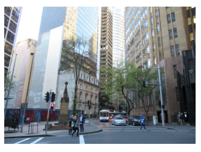
Figure 2.6 Looking north from the intersection of Castlereagh Street and Hunter Street towards Bligh Street, showing the existing context and setting of the heritage items Richard Johnson Square, Former NSW Club Building, and Former 'City Mutual Life Assurance building