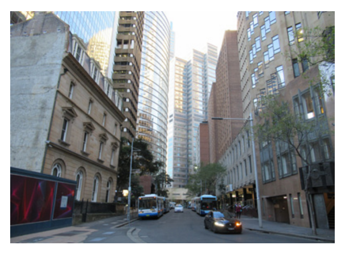
Figure 2.5 Looking north along Bligh Street showing the existing streetscape character. The heritage listed Former NSW Club Building at 31 Bligh Street is visible on the left