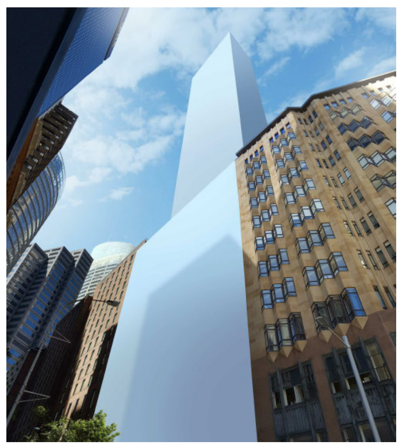
Figure 4.1 Urban Design diagram with an indicative concept proposal for the subject site