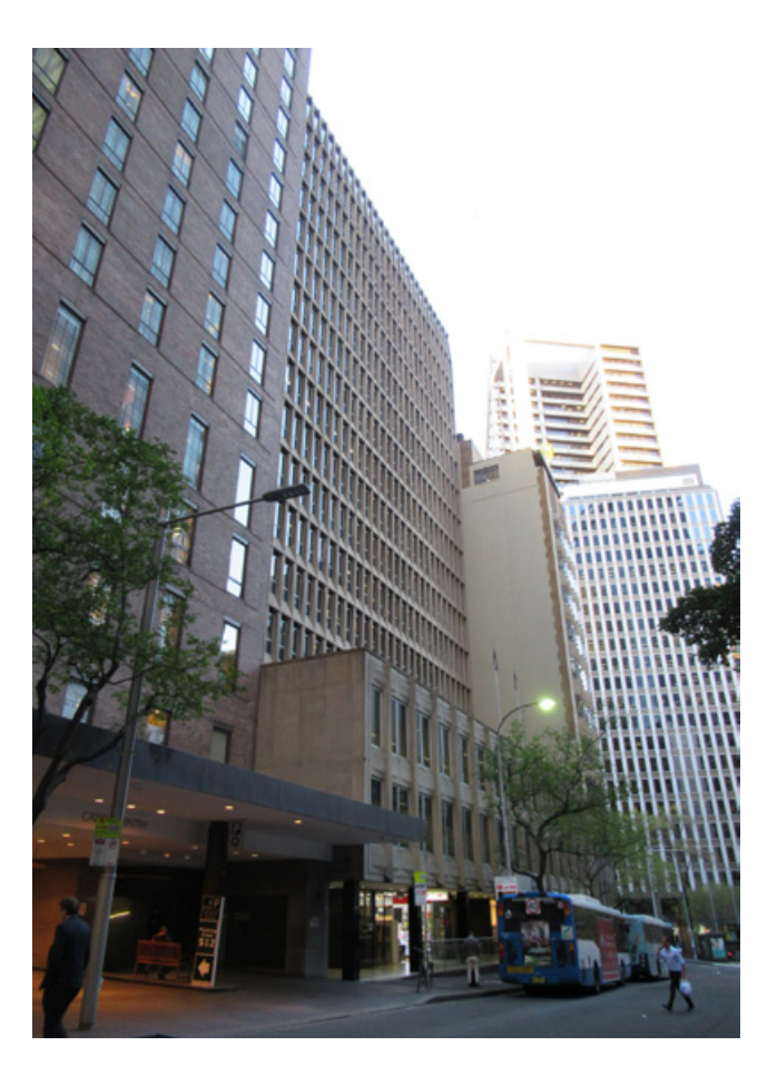
Figure 2.4 (Bottom Right) The heritage listed Former 'City Mutual Life Assurance' building at 10 Bligh Street located directly to the south of the subject site, as viewed from the intersection of Castlereagh Street and Hunter Street

Looking south west from Bligh Street towards the subject site, visible between the heritage listed Sofitel Wentworth Hotel on the left, and the heritage listed Former 'City Mutual Life Assurance' building on the right