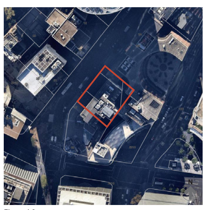
Figure 1.2 Aerial photograph showing the subject site outlined in red Source: Nearmap 6 May 2017