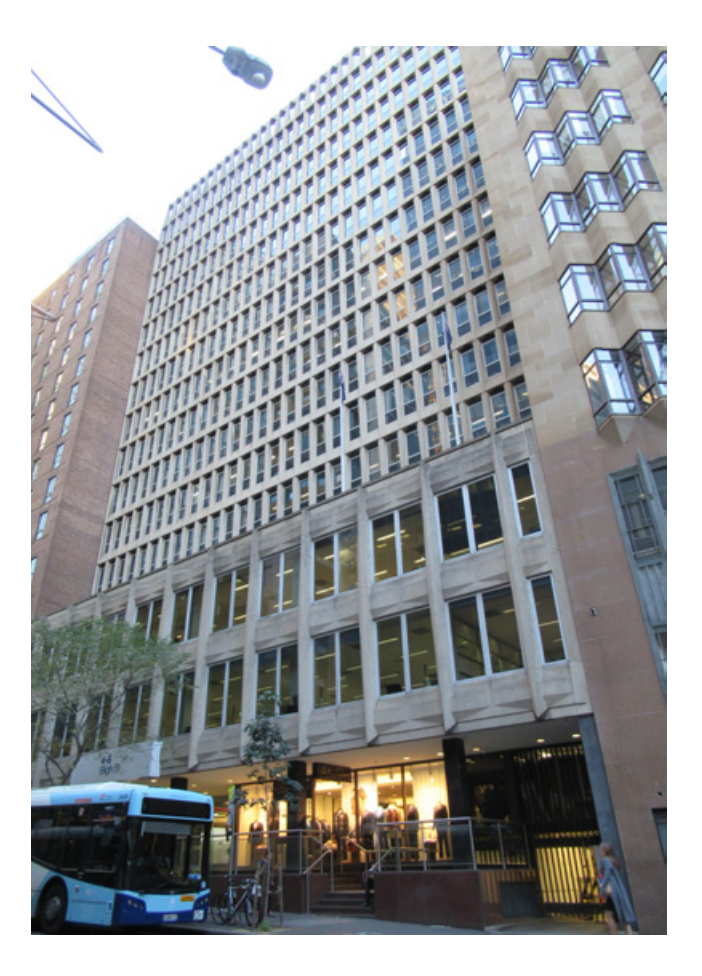
Figure 2.2 (Top Left)

The existing building on the subject site at 4-6 Bligh Street, Sydney, known as Bligh House